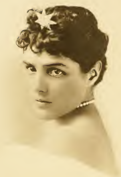
Lady Randolph Churchill